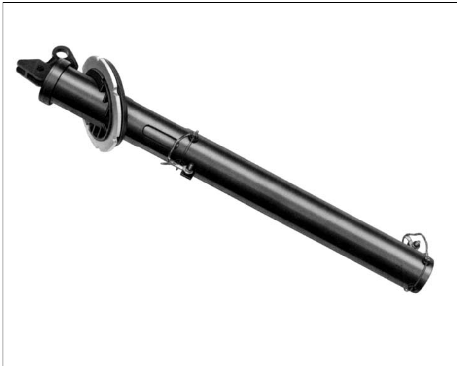
Figure 1. Bay-O-Net Fuse Assembly with hotstick operable hook eye handle.

No special tools are required. The outer tube is installed into the apparatus side wall and gasket sealed. Refer to Installation and Operating Instruction Sheet, S240-70-1.