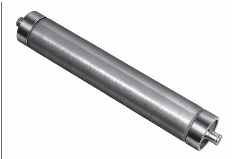
Figure 1. ELSP Current-Limiting Backup Fuse.

This two-part system provides low current protection with the replaceable expulsion fuse or resettable MagneX Interrupter, and it adds the energy-limiting protection of a current-limiting fuse. Together, they coordinate easily with upstream and downstream devices.